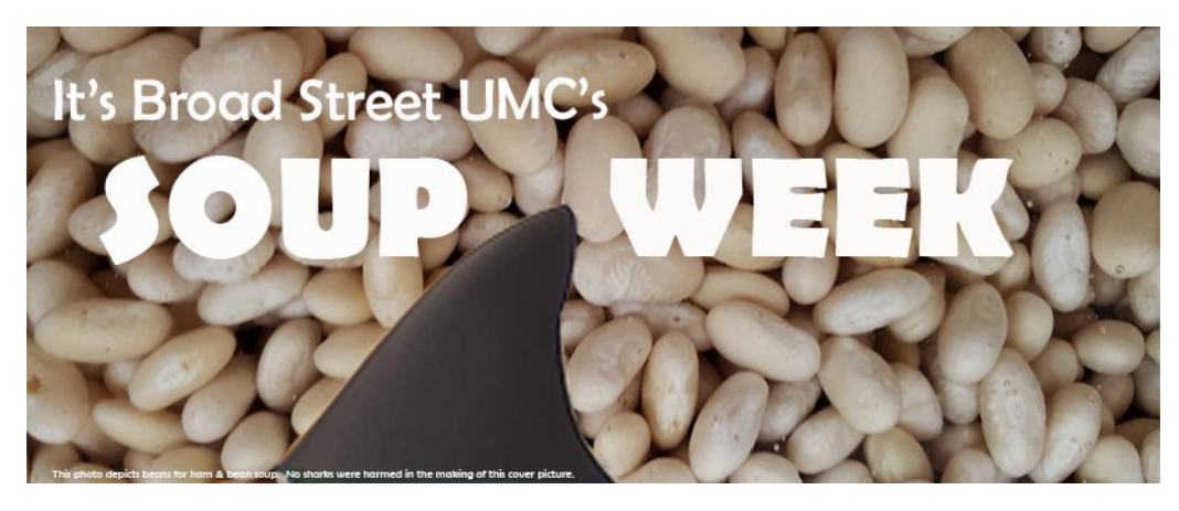
Soup Sunday – February 2, 2025

Thank you to everyone who submitted a devotional (or more than one) for our Lenten devotional booklet. We will hand out the booklets next Sunday, the first Sunday in Lent. We can accept final submissions today. We can't wait to read your stories!